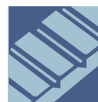
Special Barrier Material

The Godrej Fire Resisting Filing Cabinets are given a lasting scratch resistant stipple finish in Ash Grey / Moonlight Grey combination.