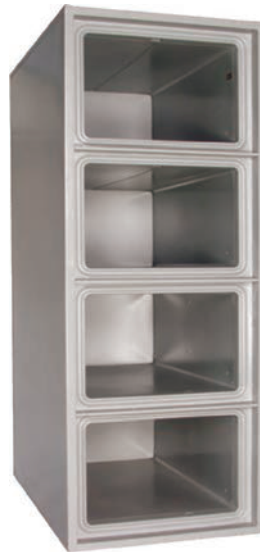
Each Drawer Individually Insulated

They have also been tested at Central Building Research Institute (CBRI) for 1hr and 2hrs of Fire Endurance, Fire and impact as per Bureau of Indian Standards IS 14581:1998.