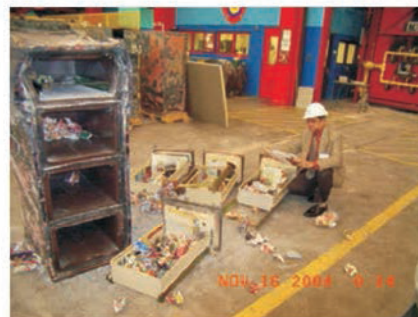
Actual Tests conducted on the Godrej FRFC at Underwriters Laboratory, USA for Fire Endurance, Fire & Impact (which includes the unique 9 metre drop test) and Explosion Hazard Test.