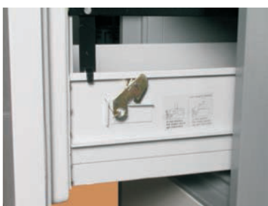
Drawer isolation catch

A simple, fullproof isolation catch provided on the right hand side of each drawer permits its independent use and locking.